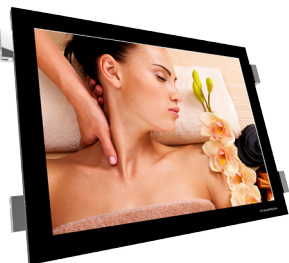
VM TWO CLIP FRAMES