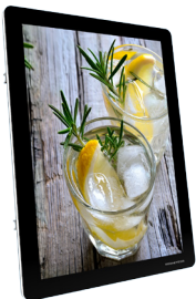
VM TWO CLIP